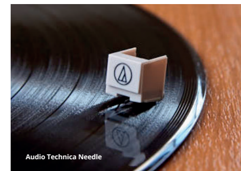
Audio Technica Needle