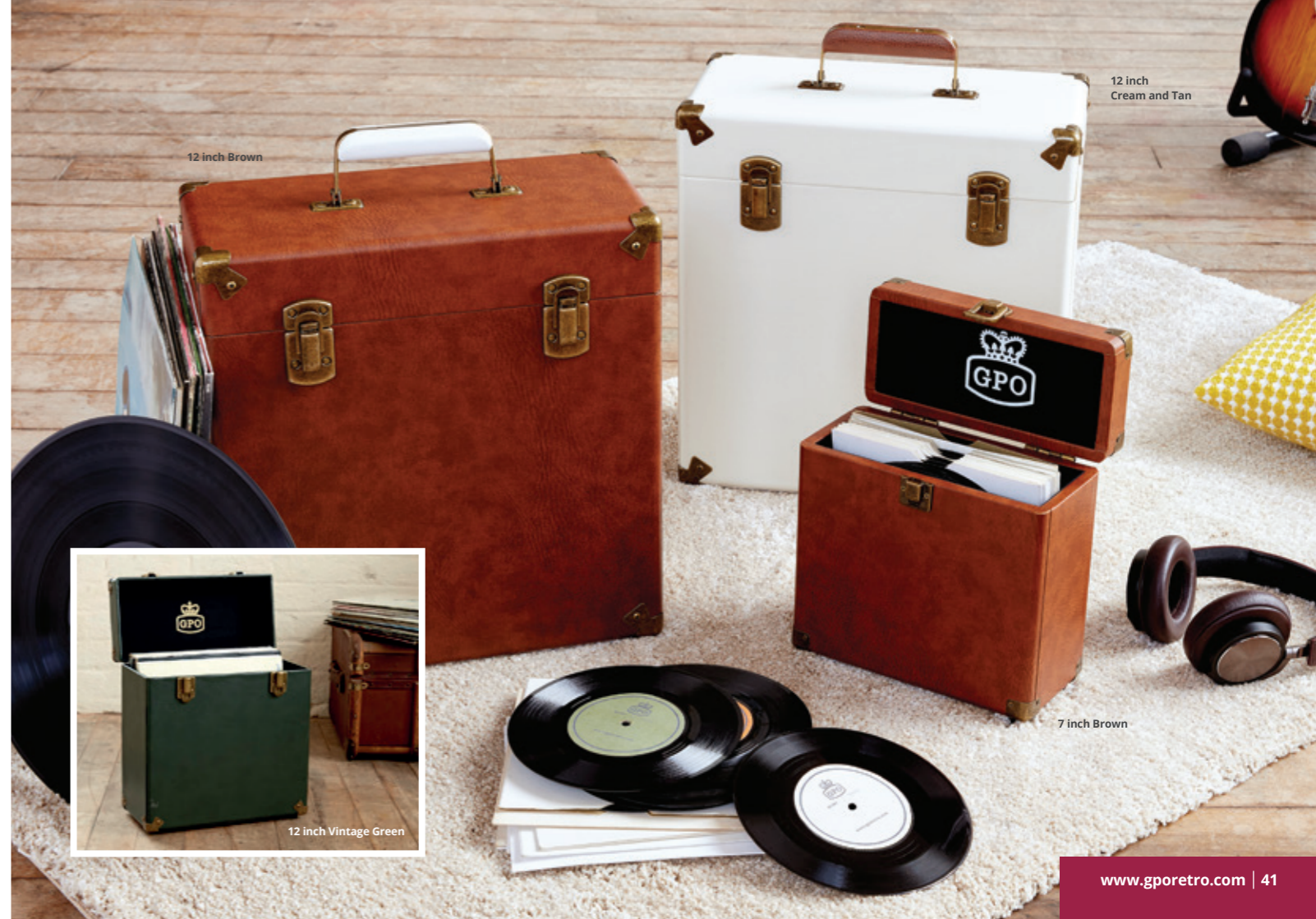
12 inch Brown