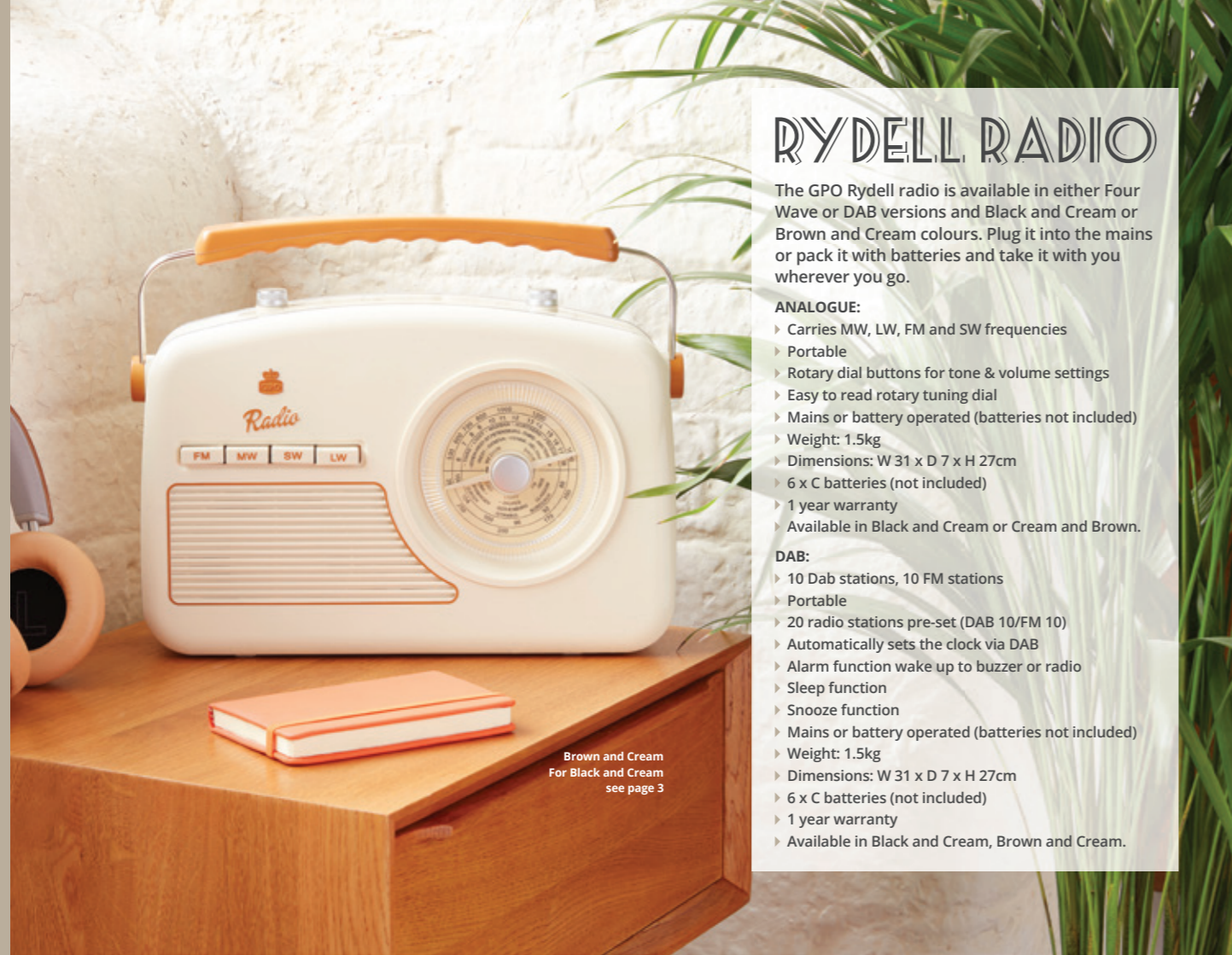
Brown and Cream For Black and Cream see page 3