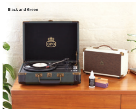
Black and Green