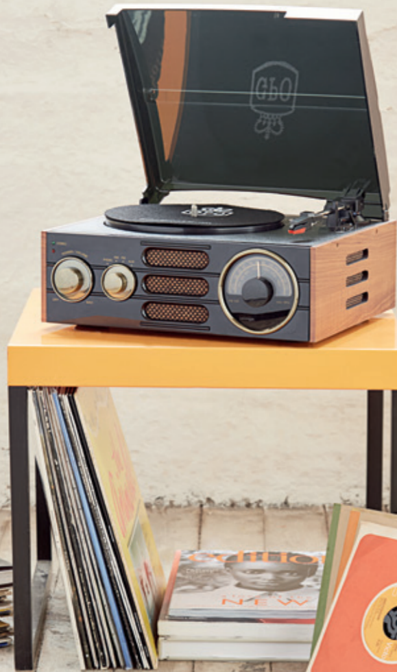
Wooden and Black Matte