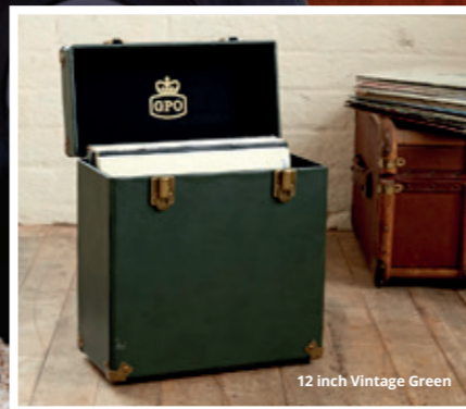
12 inch Vintage Green