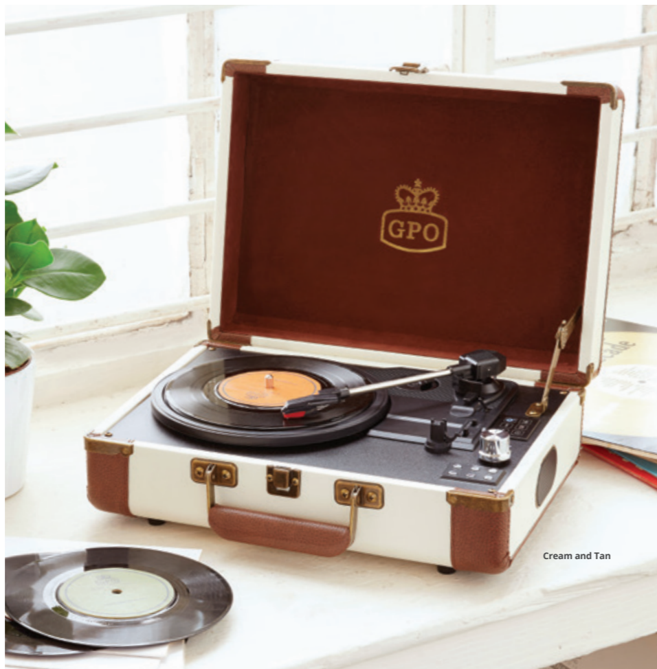
Cream and Tan