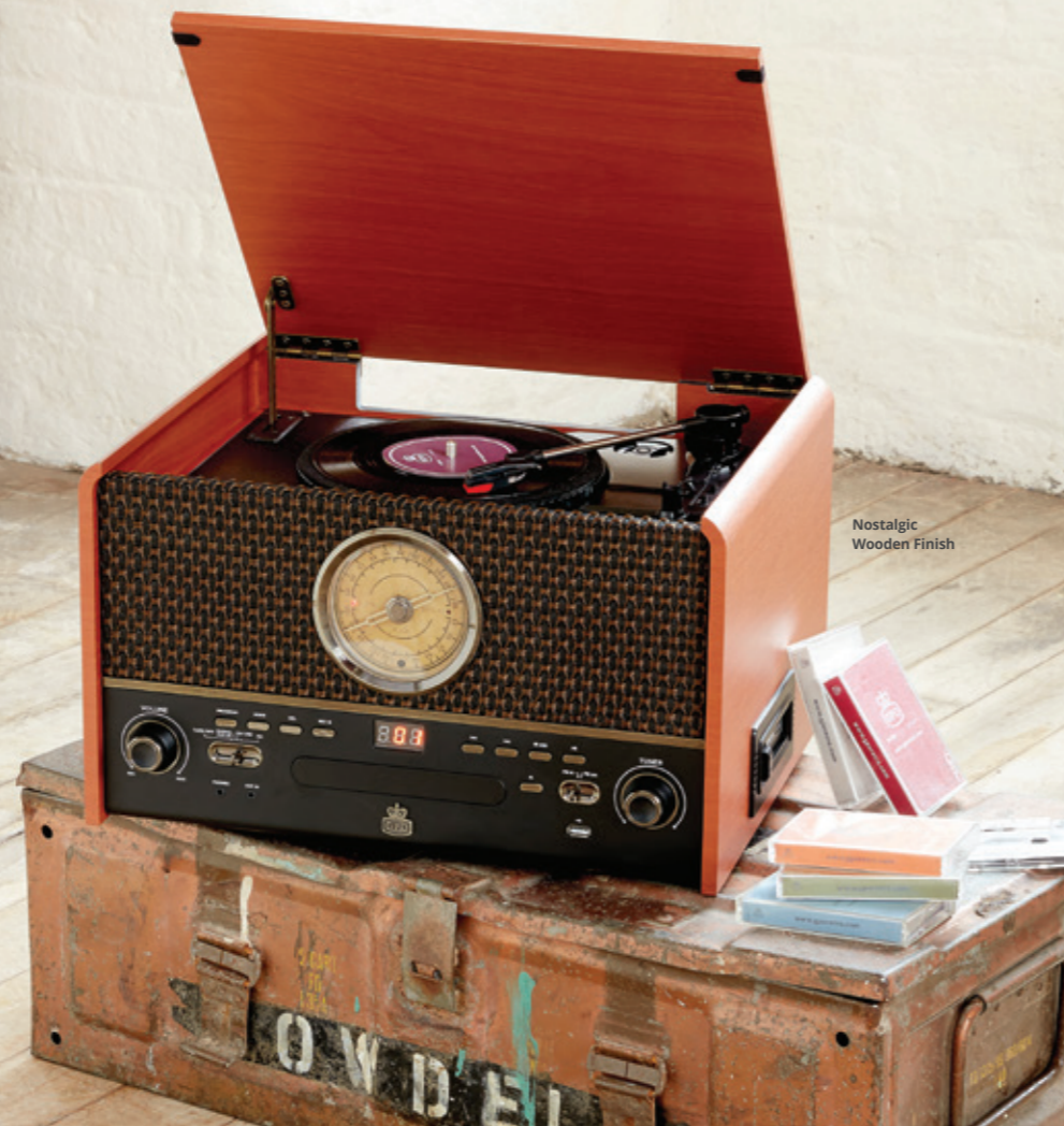
Nostalgic Wooden Finish