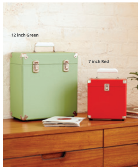
12 inch Green