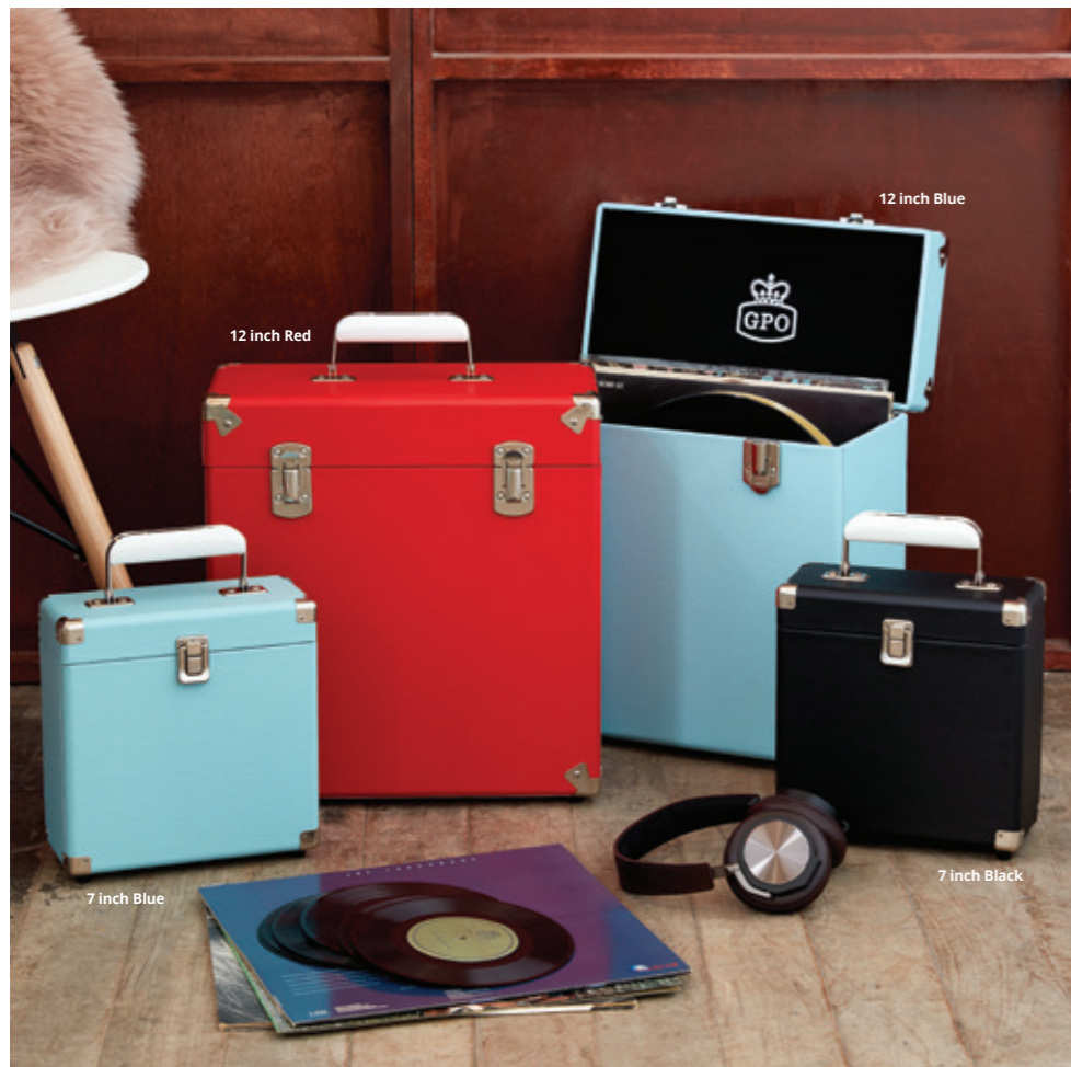
12 inch Red